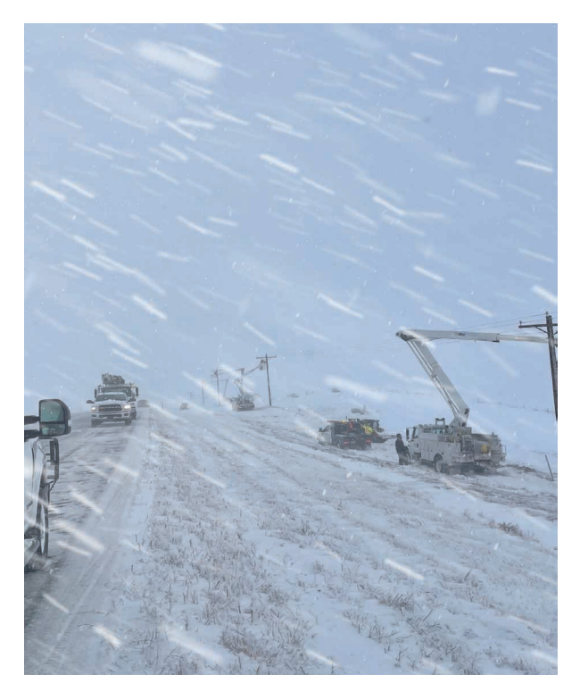
Line crews work to restore power along highway during winter storm.

If you'd like to read the full article and learn what your Co-op is doing to address future reliability, visit www.butteelectric.com/articles/reliable-energy →