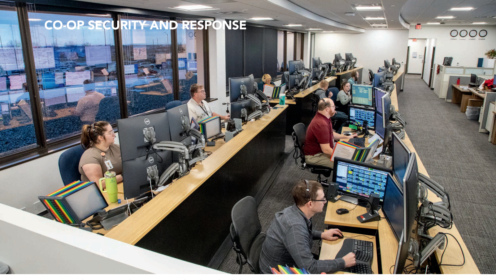
Basin Electric Security and Response Services dispatchers take calls from rural electric cooperative members at Basin's headquarters in Bismarck, N.D.