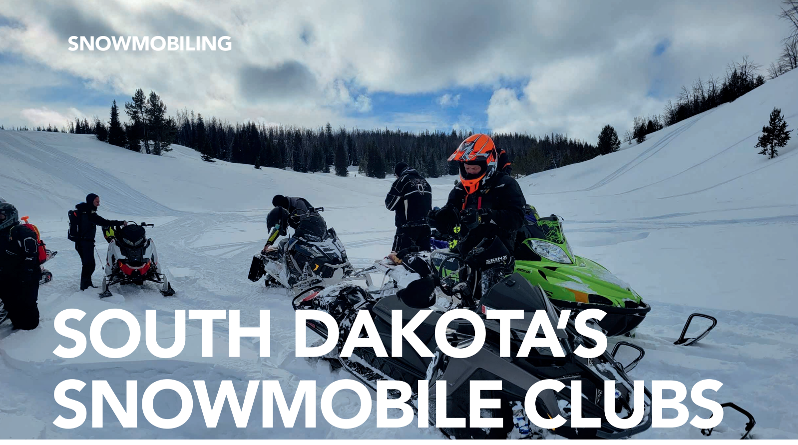
A group of Black Hills Snowmobile Club members enjoy a ride through the snow covered pines.