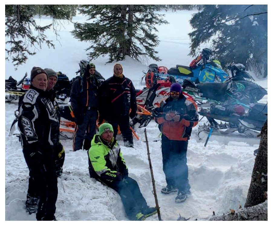
Watertown's South Dakota Snowmobile Club members take a break during an outing

More information on the state's snowmobile clubs can be found at the SDSA's website at snowmobilesd.com.