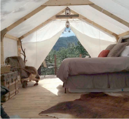
The Still House near Rapid City