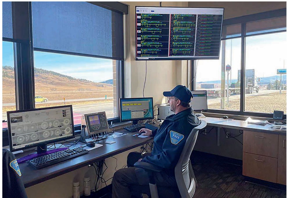
A SDHP officer has the latest technology at his or her fingertips to ensure trucks on South Dakota roads are operating safely.

"It's kind of nice to be able to do that and make the day what you want of it."