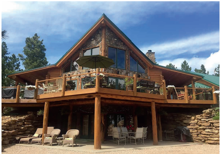
Log cabin in Vanocker Canyon