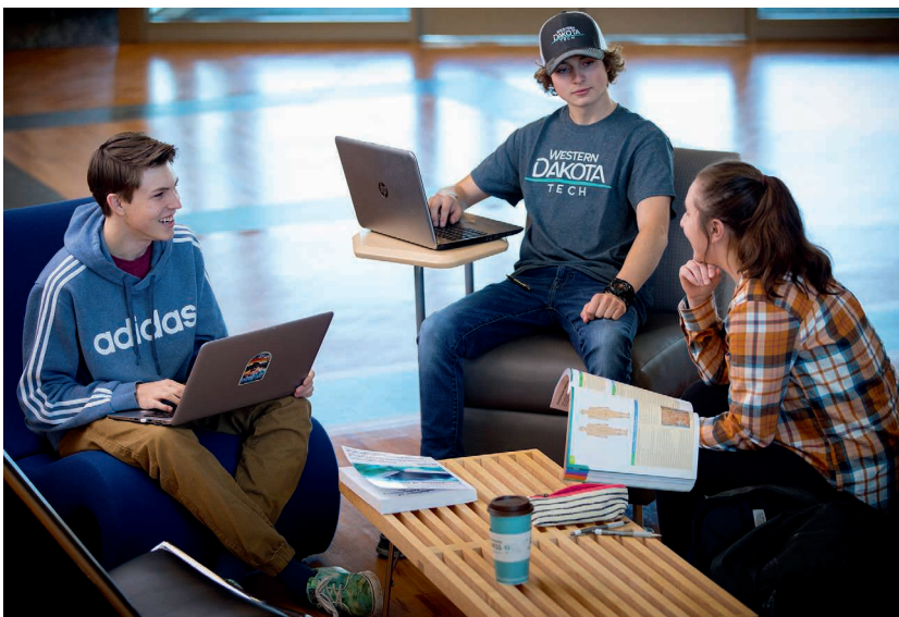
Students enrolled in Western Dakota Technical College's Dual Credit Program.

For more information on enrolling in the dual credit program, students and parents should reach out to their high school counselor's office or check out the options at https://ourdakotadreams.com/high-school/dual-credit/ .