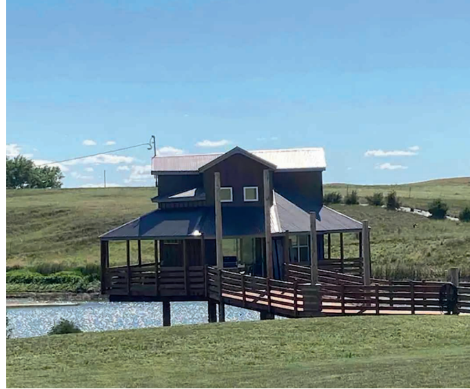
Cabin over water on the prairie near Philip