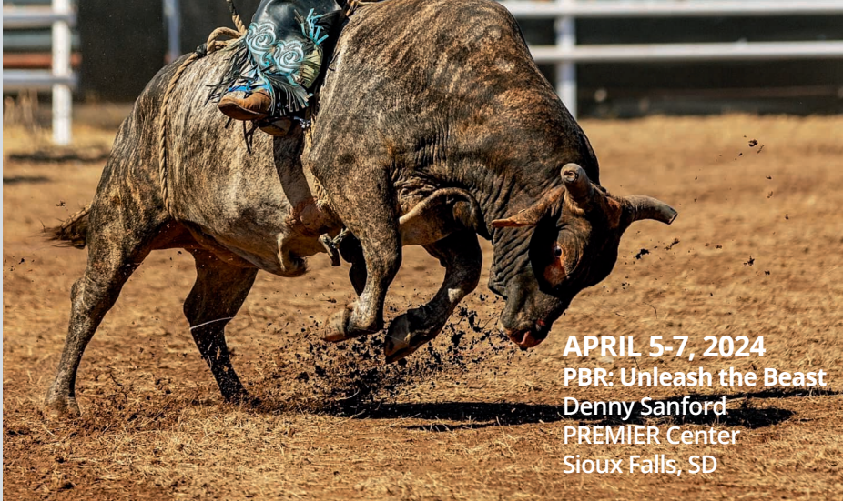
APRIL 5-7, 2024 PBR: Unleash the Beast Denny Sanford PREMIER Center Sioux Falls, SD

To have your event listed on this page, send complete information, including date, event, place and contact to your local electric cooperative. Include your name, address and daytime telephone number. Information must be submitted at least eight weeks prior to your event. Please call ahead to confirm date, time and location of event.