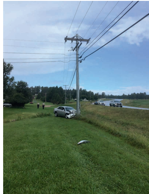
A line crew responds to a car collision with an electric pole.

neighborhoods. We shop at the same stores. Our kids go to the same schools. So, you can trust that we are doing our best to get the lights back on as quickly and safely as possible, ensuring everyone can resume their regular routines.