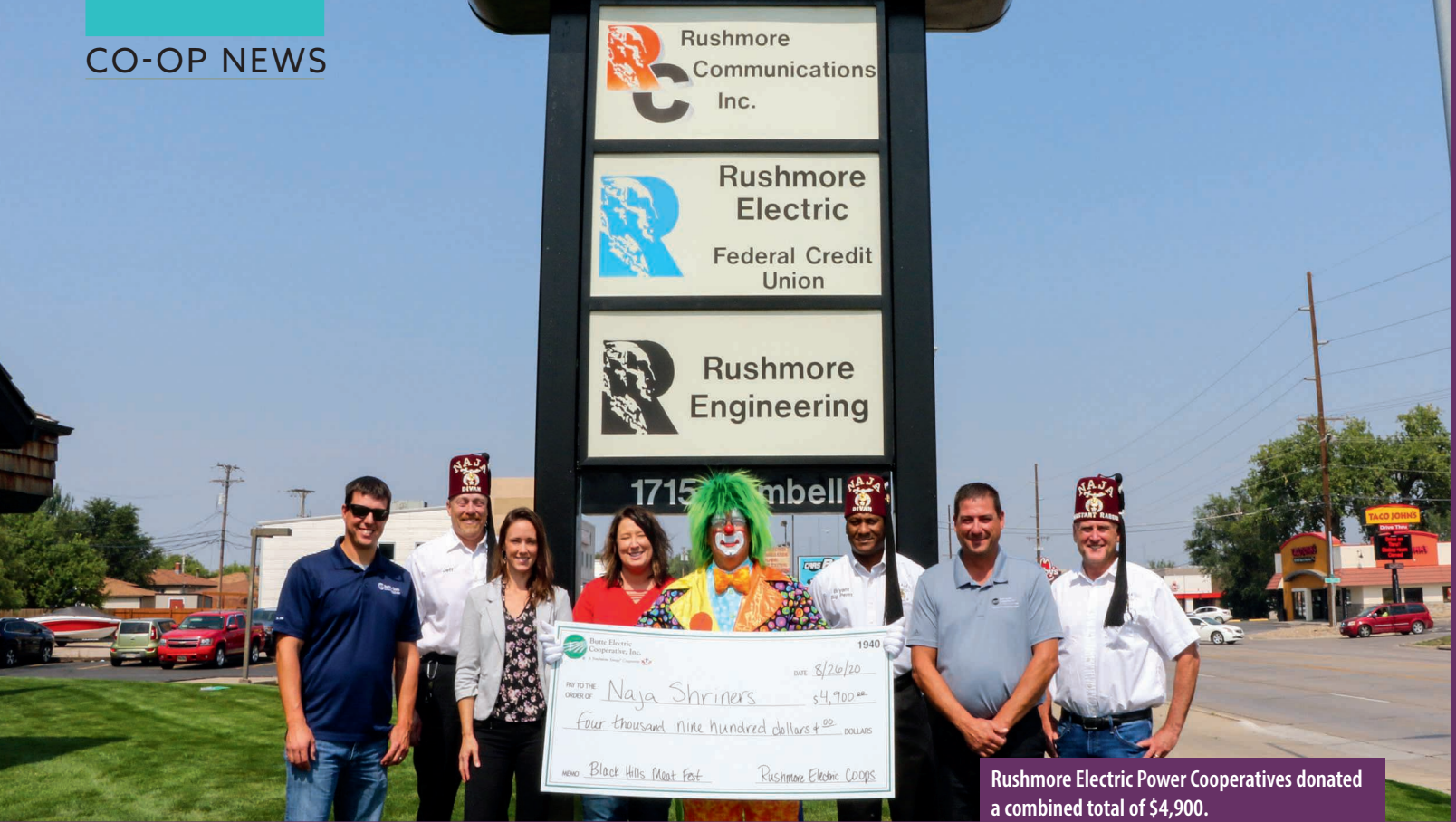
Rushmore Electric Power Cooperatives donated a combined total of $4,900.