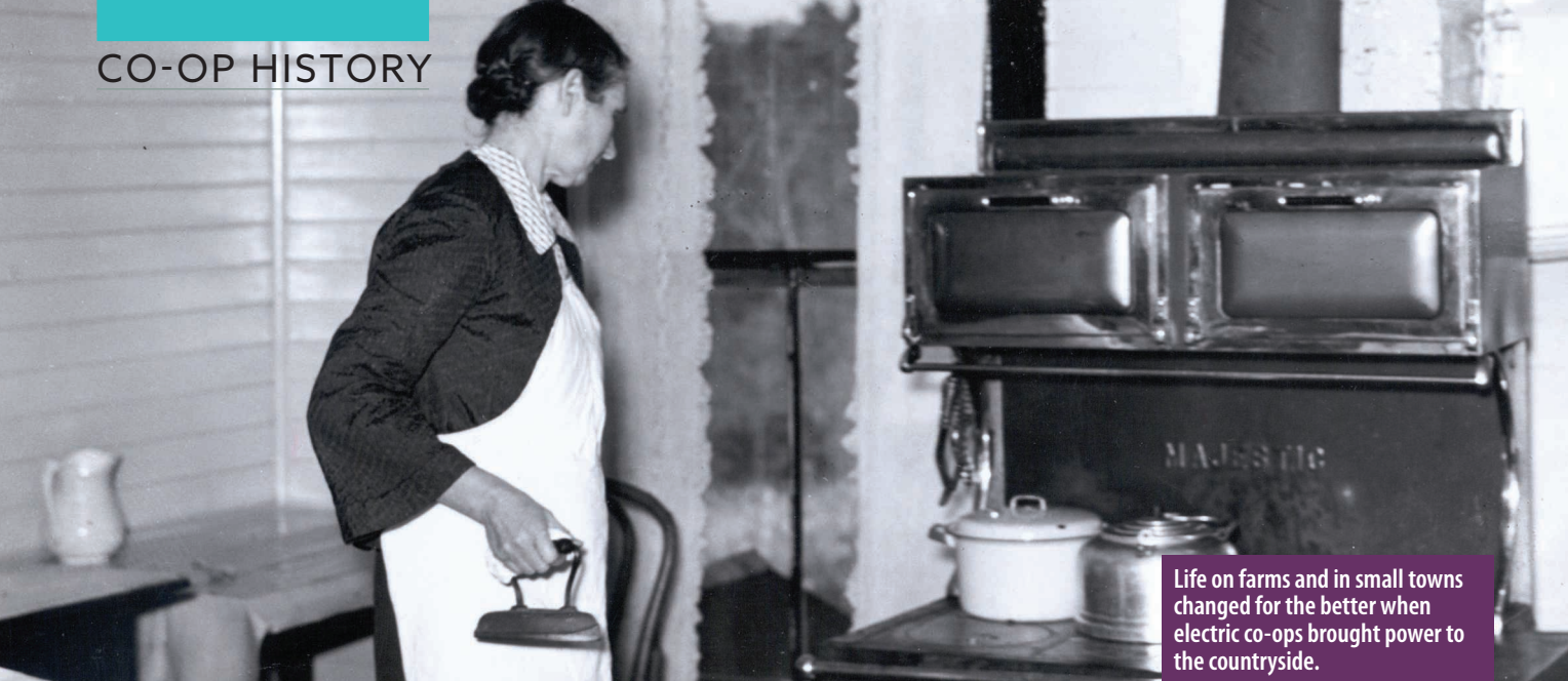
Life on farms and in small towns changed for the better when electric co-ops brought power to the countryside.