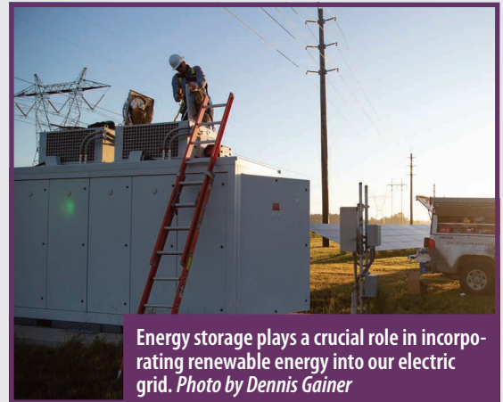
Energy storage plays a crucial role in incorporating renewable energy into our electric grid.

Although battery prices have been decreasing steadily over the last several years, energy storage can be expensive to attain. Currently, there are 25 gigawatts of electrical energy storage capacity in the U.S., and many experts expect capacity to grow.