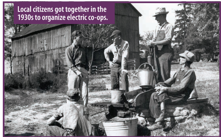
Local citizens got together in the 1930s to organize electric co-ops.

America's electric cooperatives take a great deal of pride in their legacy of service, their spirit of independence, their ability to work together for a common purpose and their democratic system of control and decision-making. It's a system rooted in the