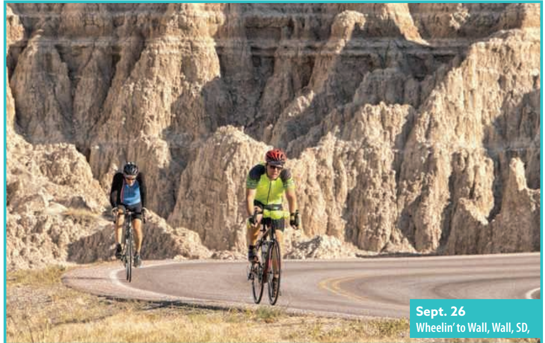
Sept. 26 Wheelin' to Wall, Wall, SD,

Cowboys, Cowgirls and Cowcatchers Soiree, 6 p.m., South Dakota State Railroad Museum, Hill City, SD, 605-574-9000