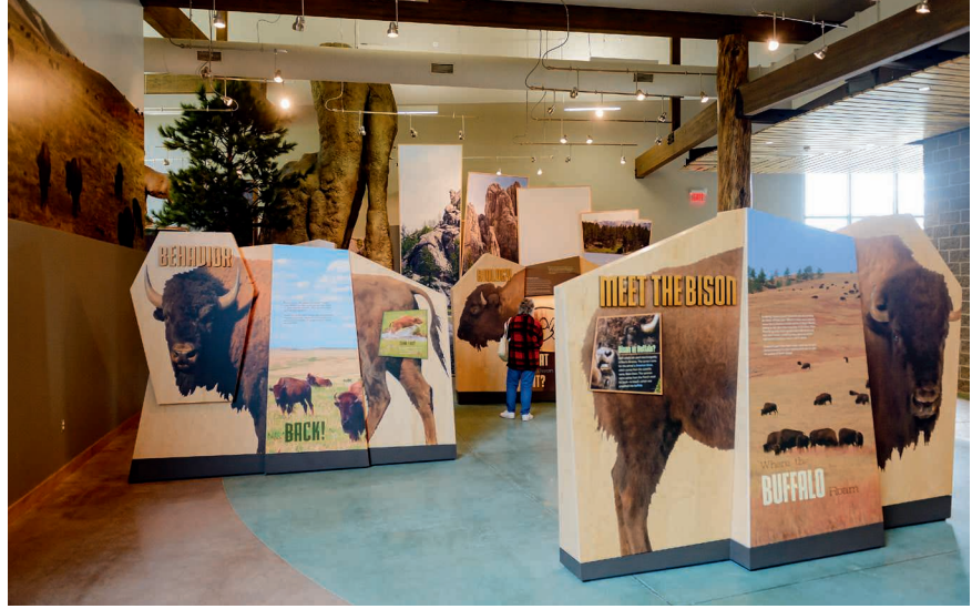
The Custer State Park Bison Center helps educate visitors about the history and importance of the herd of 1,400 buffalo that live in the park.

The biggest day of the year for the Bison Center comes in September during Custer State Park's annual Buffalo Roundup and Arts Festival. This year's event is scheduled for Sept. 28-30. The roundup itself is Sept. 29. Parking lots will open at 6:15 a.m. Mountain Time for people