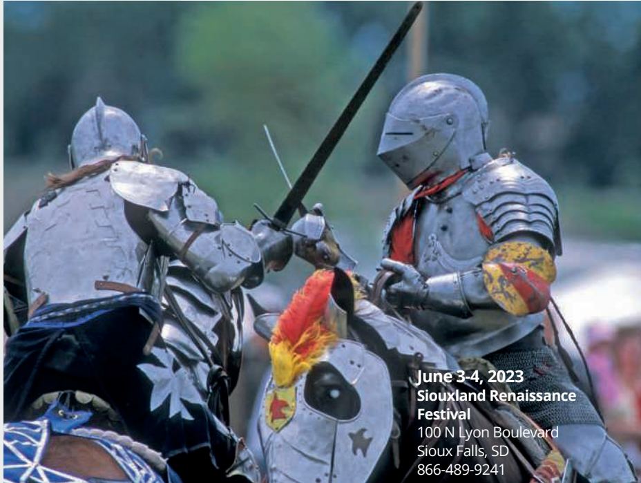
June 3-4, 2023 Siouxland Renaissance Festival 100 N Lyon Boulevard Sioux Falls, SD 866-489-9241

To have your event listed on this page, send complete information, including date, event, place and contact to your local electric cooperative. Include your name, address and daytime telephone number. Information must be submitted at least eight weeks prior to your event. Please call ahead to confirm date, time and location of event.