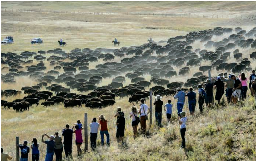
The Custer State Park Buffalo Roundup each September is popular with tourists and helps the state manage the bison that live in the park.

To learn more about the Custer State Park Bison Center, visit gfp.sd.gov/csp-bison-center/ .