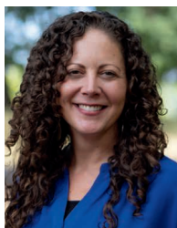
Miranda Boutelle Efficiency Services Group

A: The energy a residential well system uses depends on the equipment and water use. The homeowner is responsible for maintaining the well, ensuring drinking water is safe and paying for the electricity needed to run the well pump. Here are steps to improve and maintain your residential well and use less electricity.