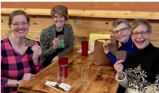
(Above) Trivia Night winners in Madison.