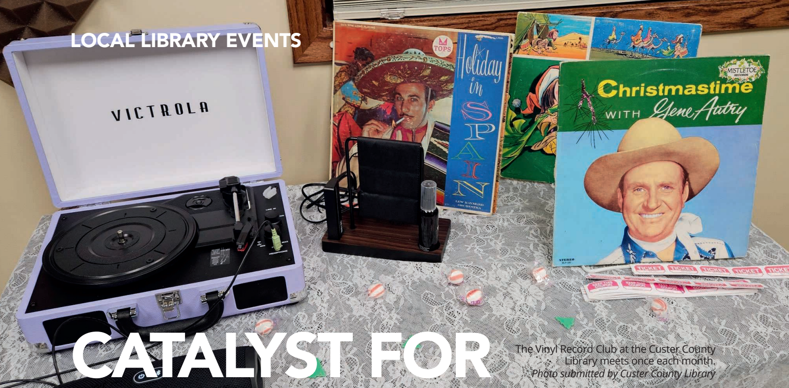
The Vinyl Record Club at the Custer County Library meets once each month.